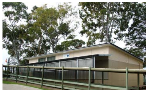
Part of our Port Macquarie Campus

Casino Campus office number 02 6662 6414